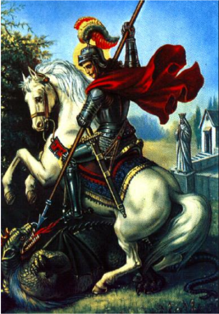
Figure 2. St. George Taming the Dragon

God gave us the sex force to drive us. And this is why it mentions in the Old Testament that those who have lost their testicles will never make it through to the kingdom of God (Deuteronomy 23:1). The sex force is a kettle that continues to fill up and through the natural release of sexual intercourse the kettle is emptied. But there are others who can learn to use the sex force for many other things like exercise and creative work. These people learn to