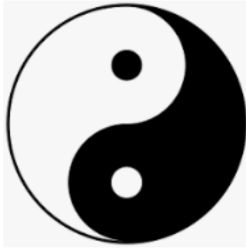
Figure 7: Yin and Yang Symbol

This is what both men and women who decide to marry should strive to achieve in their marriage. I believe that the feminine half of the equation should do its best to support the masculine so that it can go out into the world to get resources (money) to support the feminine and the offspring that the couple have.