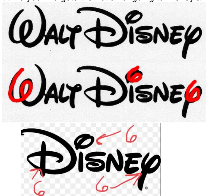
Figure 5: The number 666 hidden in plain site, inside of Disney logo

side to their life, but on the shadow side there is pure evil at work. So keep this in mind next time your kid gets the notion of going to Disneyland.