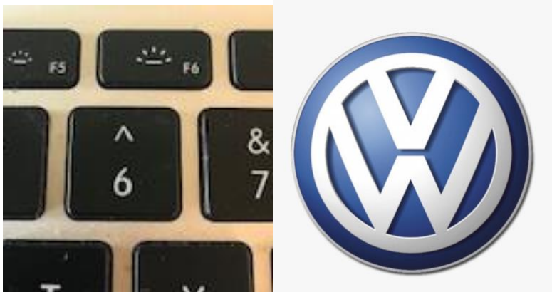
Figure 4, Six's link to the letter v.

Going further, take a look at a standard keyboard to see how the letter "V" relates to the number 6. You will notice on the six-key that there is a carrot symbol above it, which is nothing more than an upside down "v". This again has significance when you look at the Volkswagen symbol on the grille of any VW car. Some have described the symbol as indicative of the zodiac sign of Aquarius. But it's not hard to see that there are three V's within the circle, and if you convert those to one interpretation of their numerical meaning, you again wind up with the number 666.